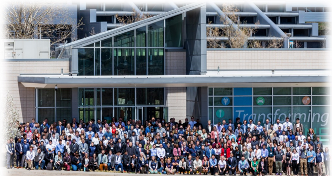
2022 Solar Decathlon participants at NREL in Golden, CO