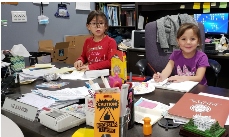
FUTURE LEADERSHIP OF SOLOMON