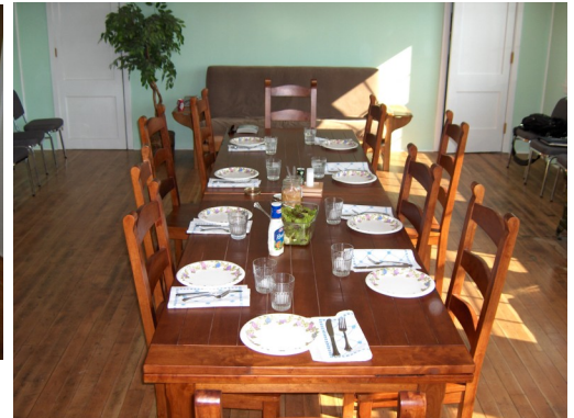
Photos L to R: North side of the B&B; a bedroom with its own patio entrance; and, the main meeting room.