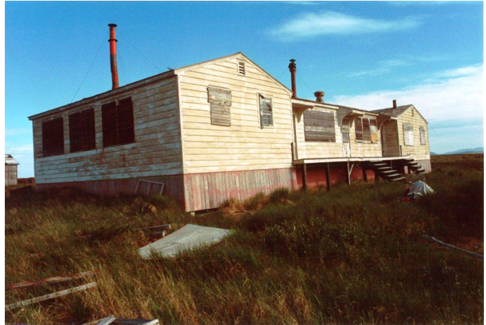
Pictured above is the schoolhouse that was abandoned when the school closed in 1956.

Five decades later, the Village of Solomon applied for and received a U.S. Department of Economic Development Administration grant to renovate the abandoned BIA schoolhouse into a viable community center and tourism venture. The Solomon Bed & Breakfast was a remarkable