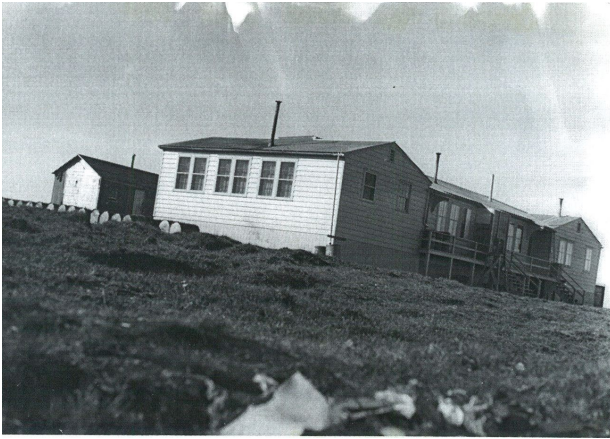
Pictured above is the schoolhouse in Solomon built in 1940.

Solomon was settled by Inupiaq Eskimos of the Fish River Tribe and was noted on maps as "Erok" in 1900. Erok was a summer fish camp for the Fish River Tribe and later became a permanent settlement. The original site was situated in the delta of the Solomon River but later moved to a place known as Jerusalem Hill. Solomon was a fast growing community in the gold rush days of 1899 and 1900 when gold fever was the instigation for expansion on the Seward Peninsula. During the big strike for gold there were anywhere from three to seven enormous dredges scouring the Solomon area for the precious yellow metal. By 1904, this gold rush boom town was the supply center for the Solomon River miners, and was the third largest Seward Peninsula town. After the gold mine rush Solomon returned to a predominately Alaska Native community of subsistence reindeer herders and miners.